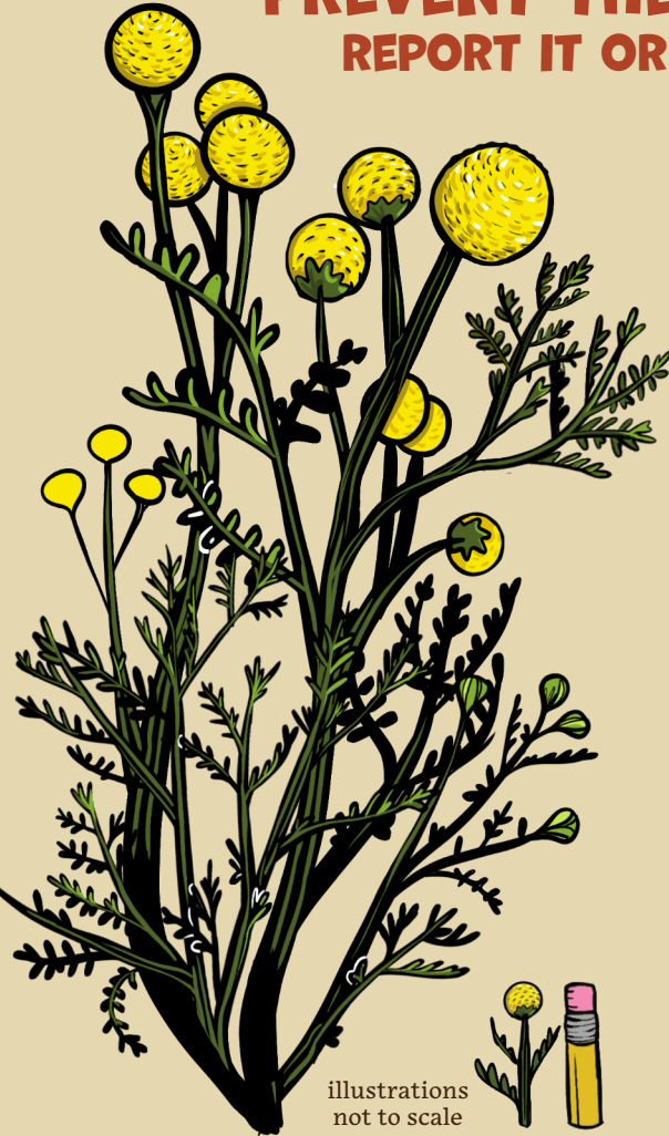
illustrations not to scale

PREVENT THE SPREAD REPORT IT OR PULL IT!