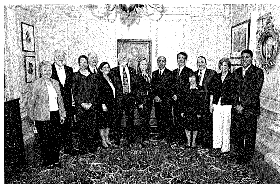
2009 JSF Announcement with Secretary Hillary Clinton