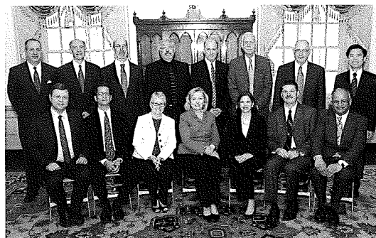
2010 JSF Announcement with Secretary Hillary Clinton

In the Essays, the applicant is asked to demonstrate his/her knowledge and understanding of the impact of science, technology, and engineering on foreign policy decision making; to discuss major advances in his/her fields of expertise that have had significant societal impact on an international scale; and to identify issues in science and technology that have not received sufficient attention by U.S. foreign policy makers.