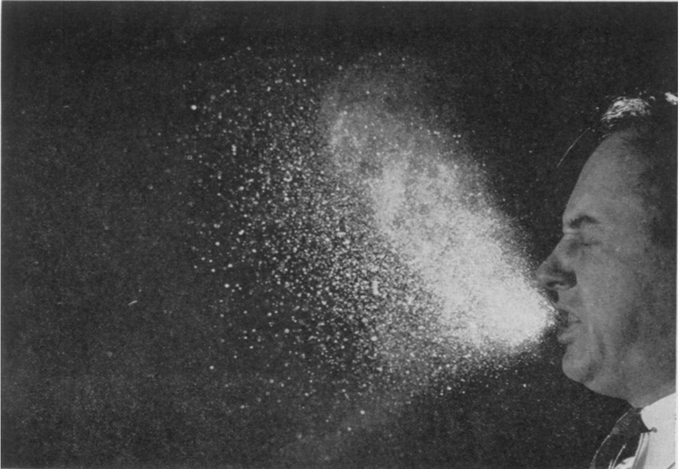
Fig 1 | Short range still imaging of stages of sneezing, revealing the liquid droplets from the 1942 Jennison experiment. 5 Reproduced with permission

Yet eight of the 10 studies in a recent systematic review showed horizontal projection of respiratory droplets beyond 2 m for particles up to 60 \mu\text{m} . 7 In one study, droplet spread was detected over 6-8 m (fig 2). 28 These results suggest that SARS-CoV-2 could spread beyond