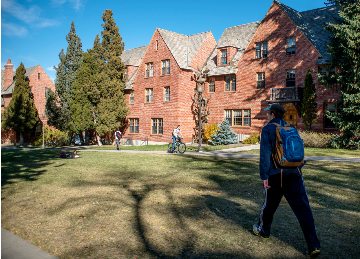
The campus of Montana State University in 2017.