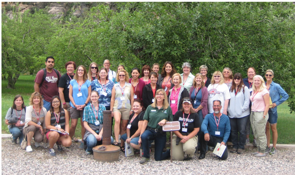
Thirty educators gathered for the Summer Agricultural Institute five-day tour designed to teach K-12 educators about food and fiber production and agriculture with practical curriculum development.