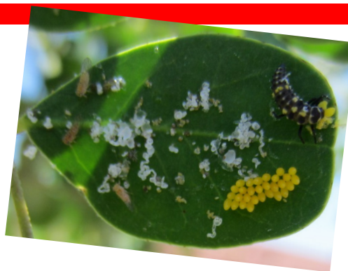
Left: Ashy gray lady beetle larva, a natural enemy of whiteflies, is unable to resist eating nutritious eggs of its own species.

Assassin bugs were seen in the tree canopies where according to Natural Enemies of the Southwest , "they stalk and ambush prey, pierce it with their needle-like beak, and inject it with venom." Parasitized nymphs are present, the result of a parasitic wasp too small to easily see.