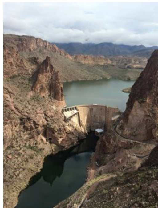
Project CENTRL Class members are able to participate in a helicopter tour by Salt River Project. This is an unforgettable opportunity to experience an aerial view of SRP's facilities and water sheds.