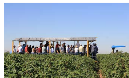
4th Annual Central Arizona Farmer Field Day