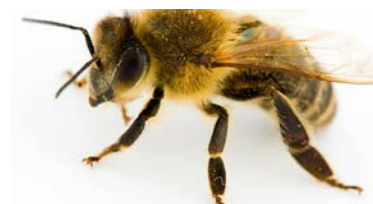
Program Spotlight - Agricultural Literacy