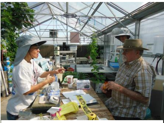
The Monday Morning 'Inner Circle' of CEAC Volunteers in the CEAC Demo Greenhouse