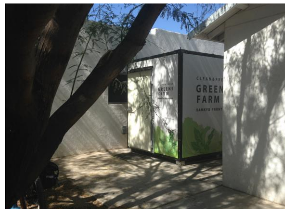
Dr. Chieri Kubota's "Veggie Box," as seen at its current location at the UA-CEAC

This 65-ft 2 system is equipped with a vertically stacked multi-layer hydroponic growing system and LED lighting. CO 2 concentration can be elevated without releasing it to the outside for maximizing crop growth. Air temperature is maintained with a heat-pump unit. The system is well insulated to minimize electric energy use. Water consumed by plants can be recovered and recycled to increase the water use efficiency. Our students will be involved in the project and gain experience in growing various leafy crops (such as lettuce and herbs) and collecting data of crop productivity and resource use. The production unit was manufactured by Sankyo Frontier Co. ( http://www.sankyofrontier.com/eng/ ), specializing in modular house building in Japan. Chiba University ( http://www.h.chiba-u.jp/english/7/index_e.htm ) and Plant Factory Association of Japan ( http://npoplantfactory.org/ ) are supporting the project and will initiate a student and faculty exchange program around this high-tech CEA.