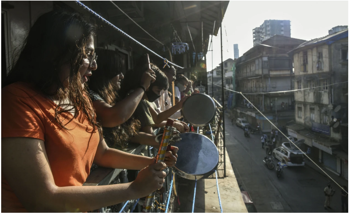
Women bang pots and pans to show their support for the emergency services dealing with the coronavirus outbreak

March was busy too. The first two weeks were devoted to toppling the Congress government in the central Indian state of Madhya Pradesh and installing a BJP government in its place. On March 11 the World Health Organization declared that Covid-19 was a pandemic. Two days later, on March 13, the health ministry said that corona “is not a health emergency”.