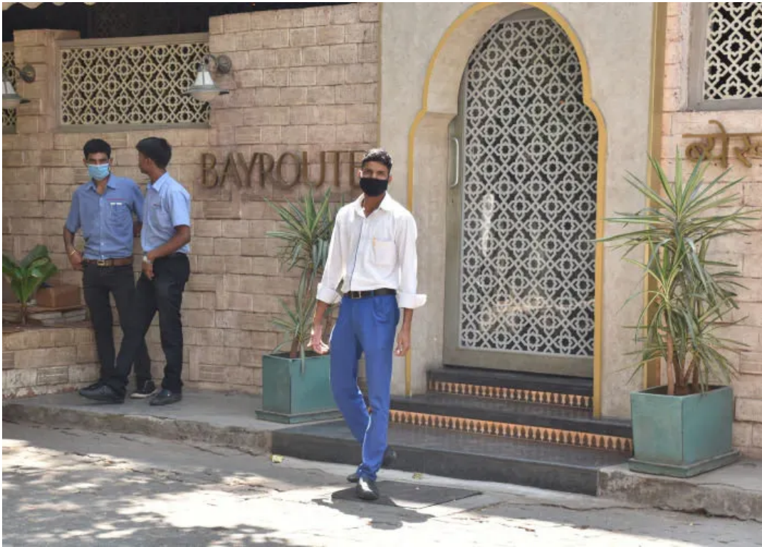
A resident wears a face mask in Mumbai, where the usually bustling streets are almost deserted. . .