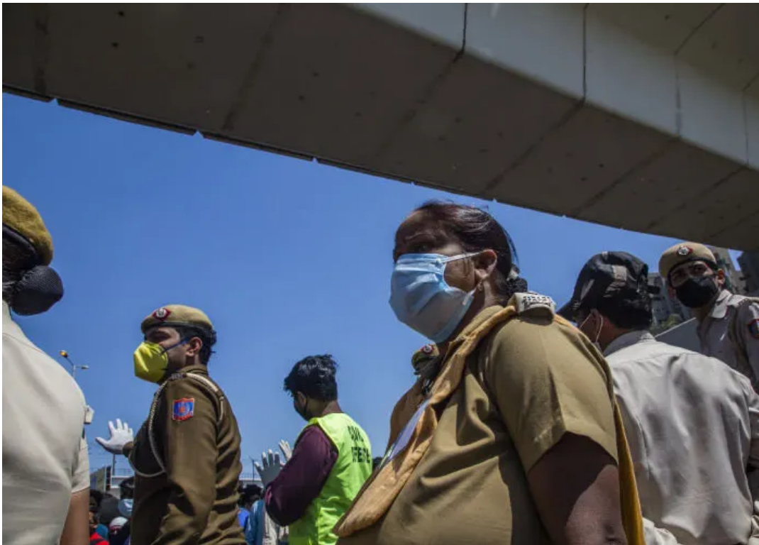
Migrant workers in New Delhi wait to board buses