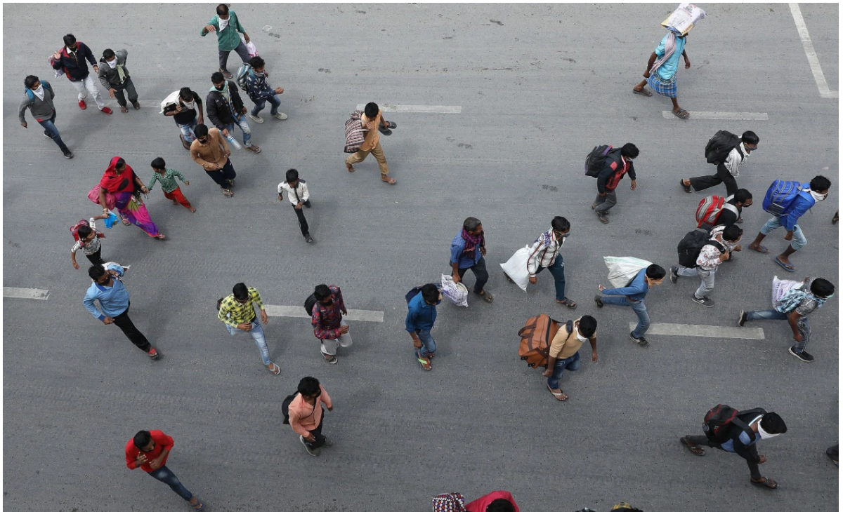
Migrant workers head towards a highway leading out of New Delhi, hoping to return to their home villages

Among older people it evoked memories of the population transfer of 1947, when India was divided and Pakistan was born. Except that this current exodus was driven by class divisions, not religion. Even still, these were not India's poorest people. These were people who had (at least until now) work in the city and homes to return to. The jobless, the homeless and the despairing remained where they were, in the cities as well as the countryside, where deep distress was growing long before this tragedy occurred. All through these horrible days, the home affairs minister Amit Shah remained absent from public view.