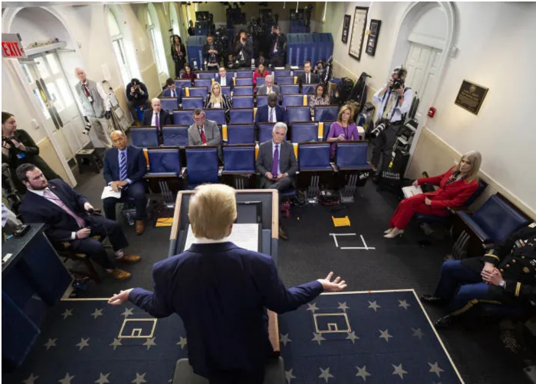
Donald Trump speaks about the coronavirus at a White House briefing on April 1, as the number of US cases topped 200,000