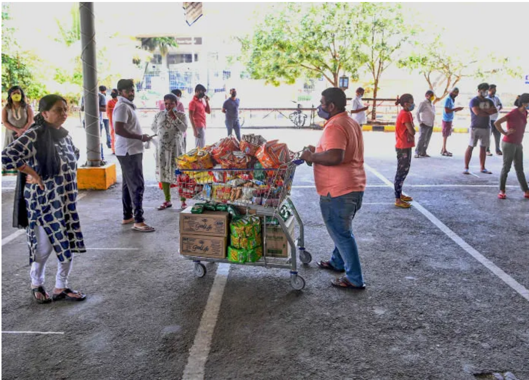
. . . while in Bangalore people queue to buy supplies at a supermarket

As an appalled world watched, India revealed herself in all her shame — her brutal, structural, social and economic inequality, her callous indifference to suffering.