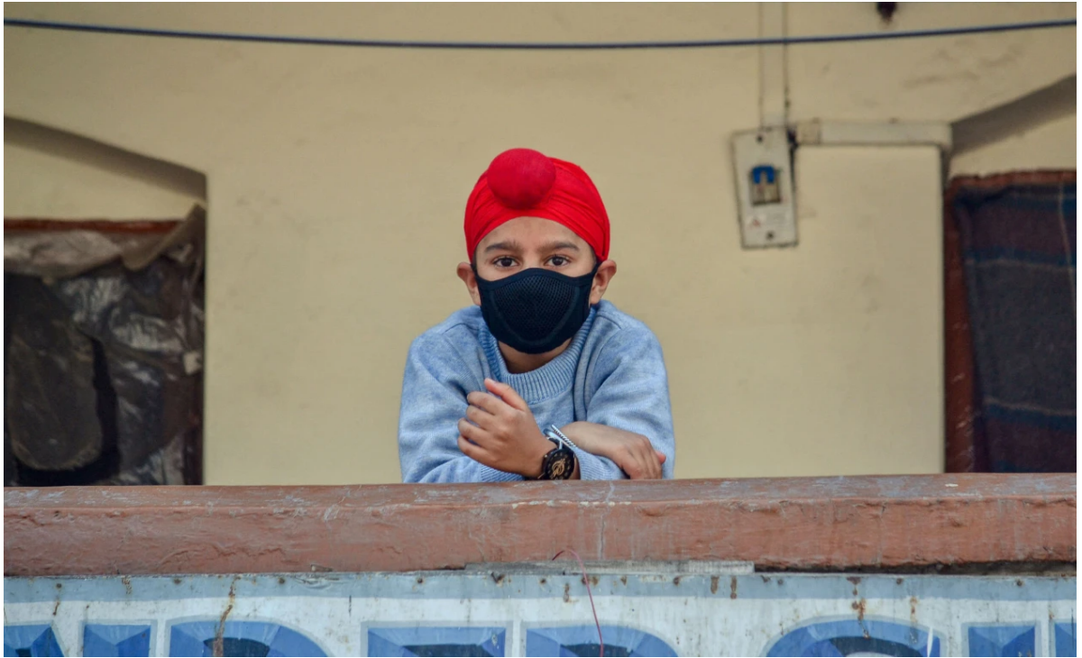
A boy wearing a protective mask ventures on to a balcony in Srinagar, which recorded Kashmir's first coronavirus death in late March

People will fall sick and die at home. We may never know their stories. They may not even become statistics. We can only hope that the studies that say the virus likes cold weather are correct (though other researchers have cast doubt on this). Never have a people longed so irrationally and so much for a burning, punishing Indian summer.