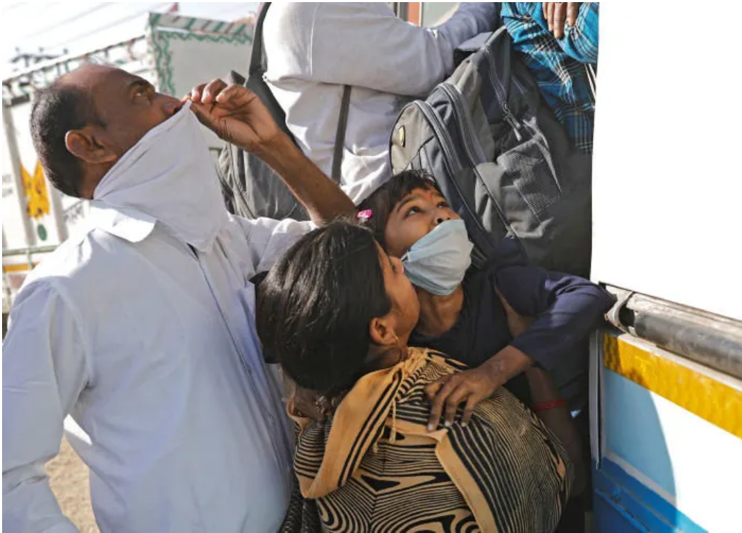
On the outskirts of New Delhi on March 29, a woman pushes her daughter on to an overcrowded bus as they attempt the journey back to their home village