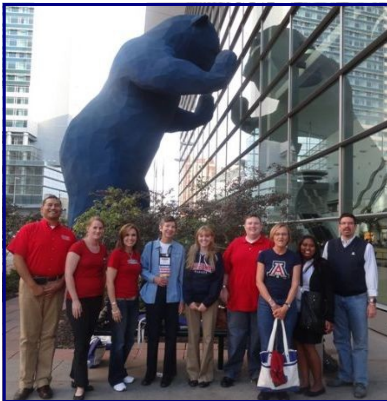
The UA Contingent!

NACADA UAccess Student Update A Good Practice The Mentor Advisor Notes From Career Services Mark Your Calendars Senior Year Experience